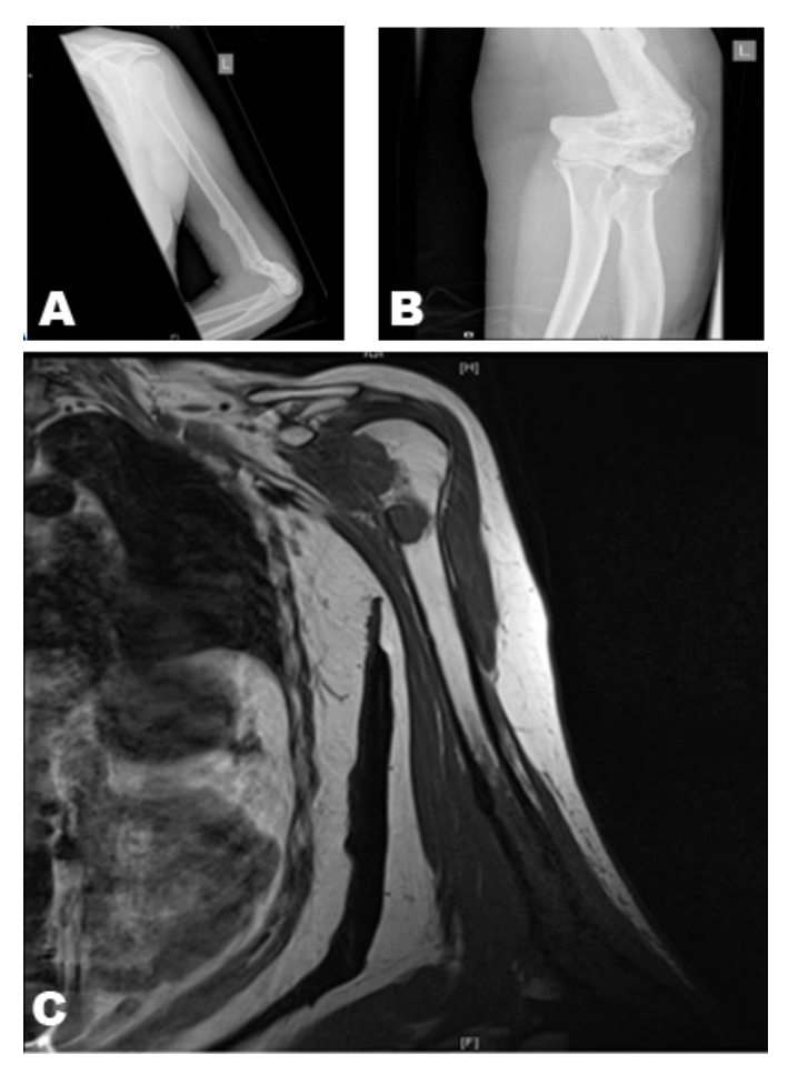
Figure 1: (A, B) Lateral and anteroposterior radiographs of the left elbow showing the fracture. (C) T1 coronal view magnetic resonance imaging scan showing the extensive involvement of distal humerus with multiple metastatic lesions in proximal humerus.

With advances in imaging, staging and perioperative oncological management, life expectancy has increased and the debate as to whether salvage or amputate the limb has shifted to the former. Nowadays, reconstruction